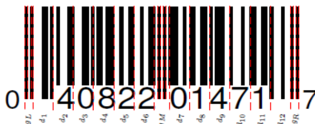
Figure(2): UPC-A barcode, encoding 12 digits

1D-barcode patterns are characterized by a rectangular array of parallel lines. The particular symbol we focus on in this paper is UPC-A, which is widespread in North America and encodes a total of 12 decimal digits (one of which is a checksum digit that is a function of the preceding eleven digits). The UPC-A pattern contains a sequence of 29 white and 30 black bars, for a total of 60 edges of alternating polarity.